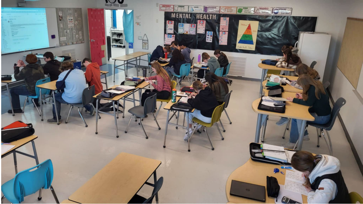
Irma School Math Prep