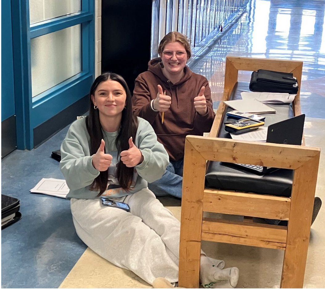
Two WHS students working on Math 30-2 online