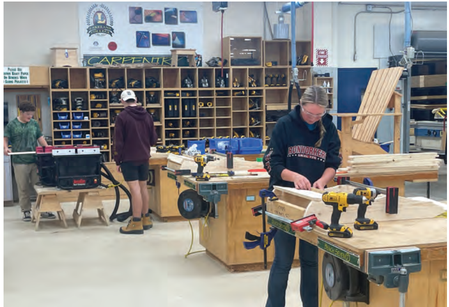
Carpentry students in action.

At the heart of this partnership lies the invaluable learning opportunities and enriching experiences that students gain. The true impact of this collaboration is best reflected in the voices of the students themselves, who have shared a range of insights about their experiences. One student noted, “I got to be with like-minded kids, which helped to motivate me, and I got to do something that I enjoy.” Another remarked, “I received an actual college-level education with actual college instructors while still in high school – pretty cool.” Others highlighted personal growth, with one student sharing, “I have learned a lot and discovered how to balance my life and focus on what I need to do instead of what I want to do.” Another student expressed academic achievement and future aspirations: “I completed Psychology with an 80 per cent and felt as if my writing really developed throughout the course. I would love to maintain or push the limits of this skill, so I would like to take any other Dual Credit course because they really help you