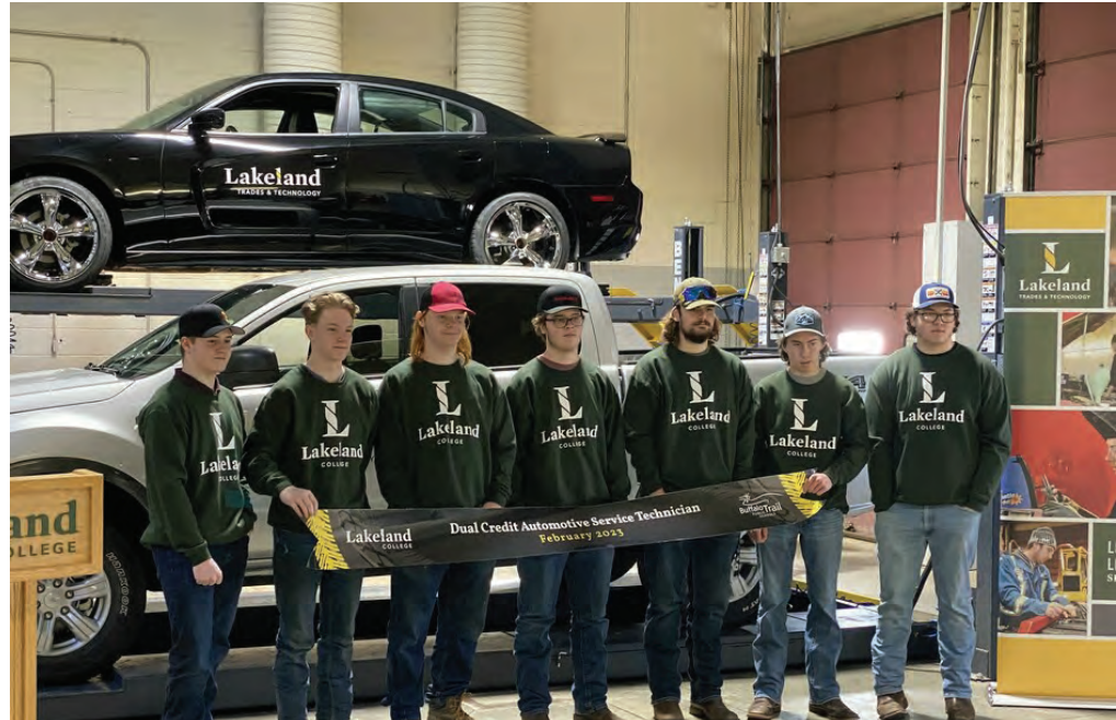
Students who are a part of the Lakeland College Dual Credit Automotive Service Technician program for 2025.

“We are proud of our ongoing collaboration with Buffalo Trail Public Schools to provide opportunities for high school