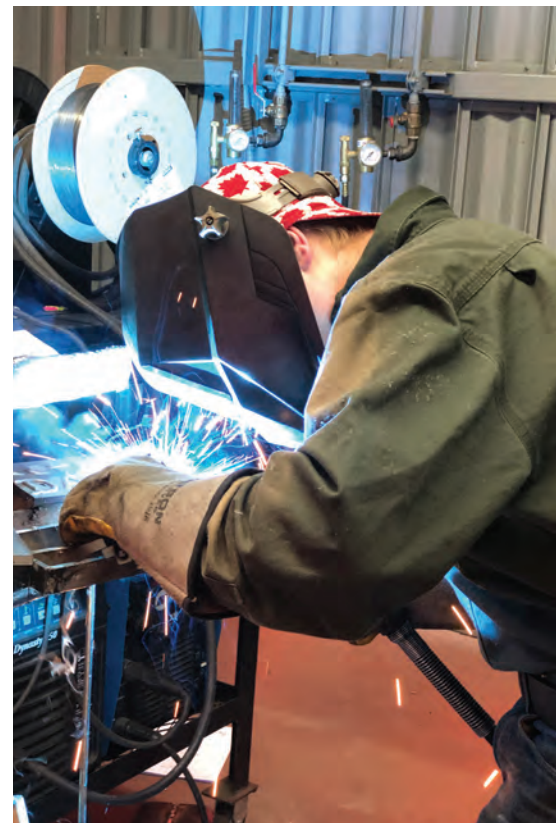
A student participating in the welding program.

Furthermore, as we prepare students for life beyond the K-12 system, these partnerships facilitate a seamless transition to post-secondary education by offering them an early exposure to the rigor and expectations of higher learning. The unprecedented quality of these experiences fosters a supportive environment that equips students with the